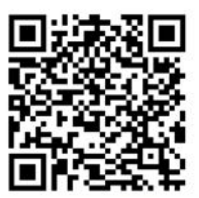
SignUpGenius link tinyurl.com/thrift-signup