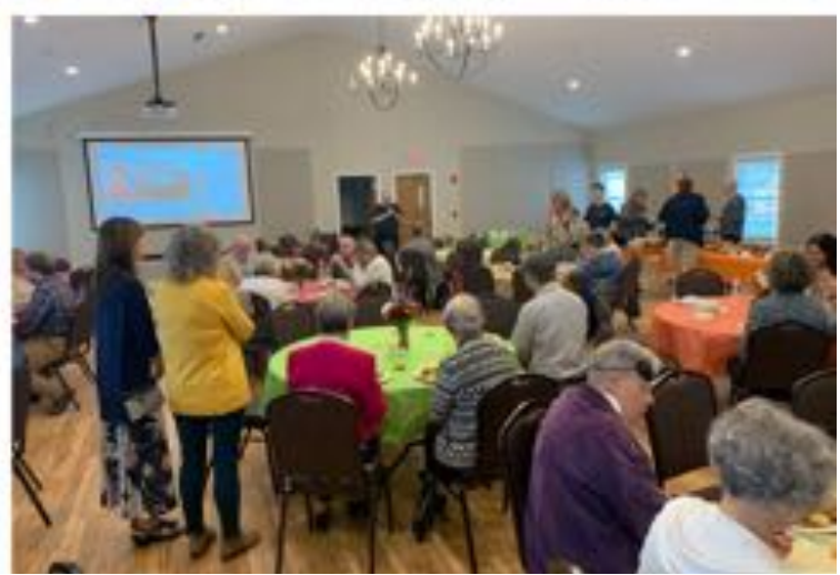
St. Peter's Church An Episcopal community sharing Christ's love since 1702.